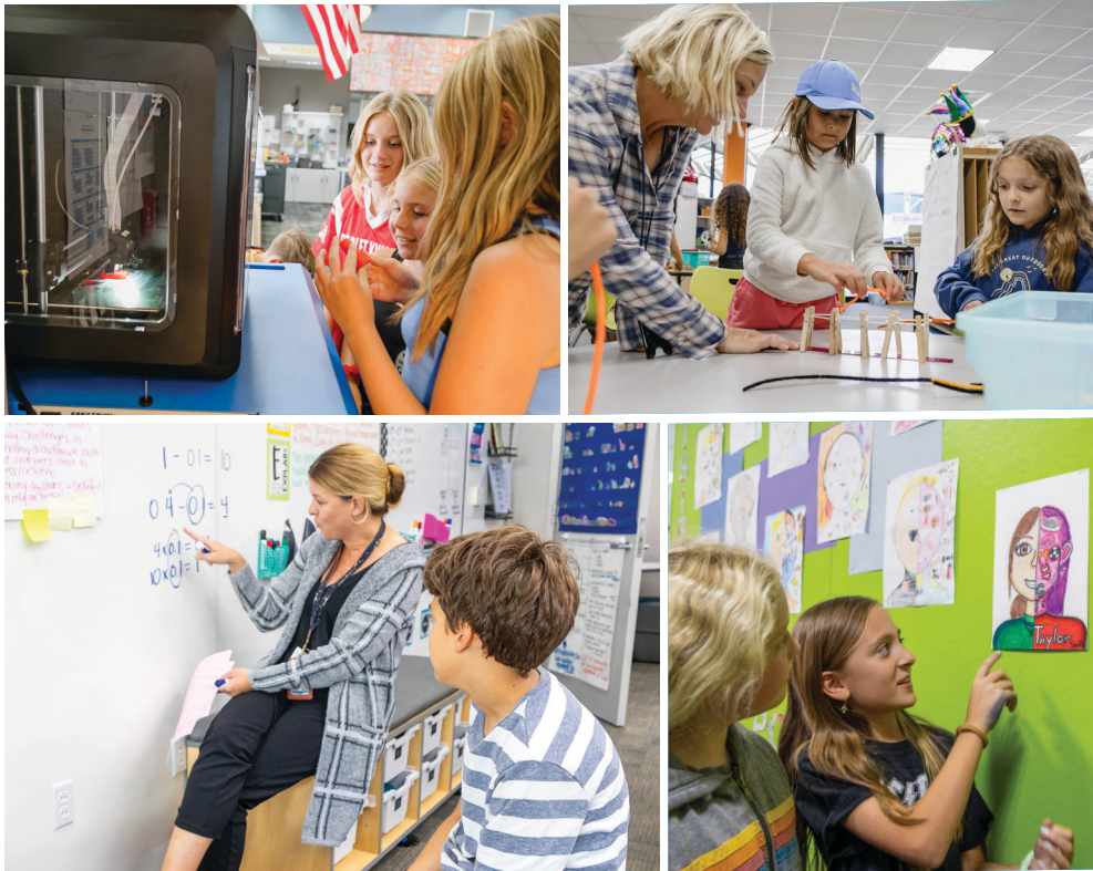
Students engage in rich and meaningful learning beyond mere memorization and routine, encouraging them to think critically, produce new ideas, work collaboratively, and effectively communicate their thinking with others.